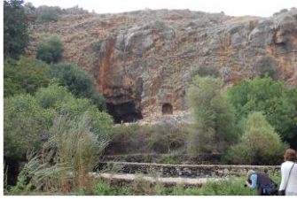
Book of Enoch Issues

The base of Mt Hermon, atop Caesarea Philippi is talked about in the Bible: